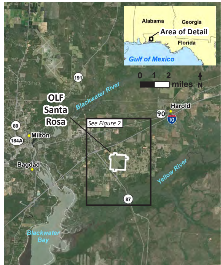
Figure 1 – OLF Santa Rosa

In 2020, a comprehensive Preliminary Assessment (PA) was completed at the OLFs in Florida associated with NAS Whiting Field. It identified potential historical releases of firefighting foam to the environment during activities such as testing, training, firefighting, and other life-saving emergency responses. The PA confirmed that firefighting foam was released to the environment at one site, the Firehouse/Blockhouse. It also identified additional sites, the Aircraft Mishaps, where