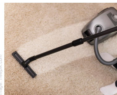
stain-resistant carpets and fabrics