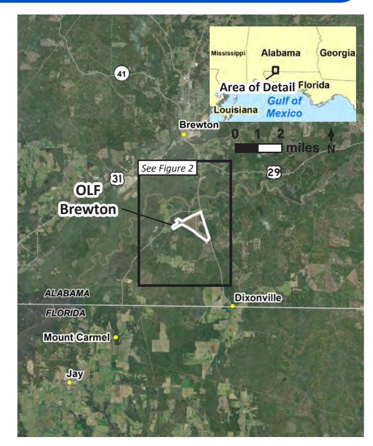
Figure 1 – OLF Brewton

In 2020, a comprehensive Preliminary Assessment (PA) was completed at the OLFs in Alabama associated with NAS Whiting Field. It identified potential historical releases of firefighting foam to the environment during activities such as testing, training, firefighting, and other life-saving emergency responses. The PA confirmed that firefighting foam was released to the environment at one site, the Airfield Parking Ramp AFFF Release. It also identified an additional site, the