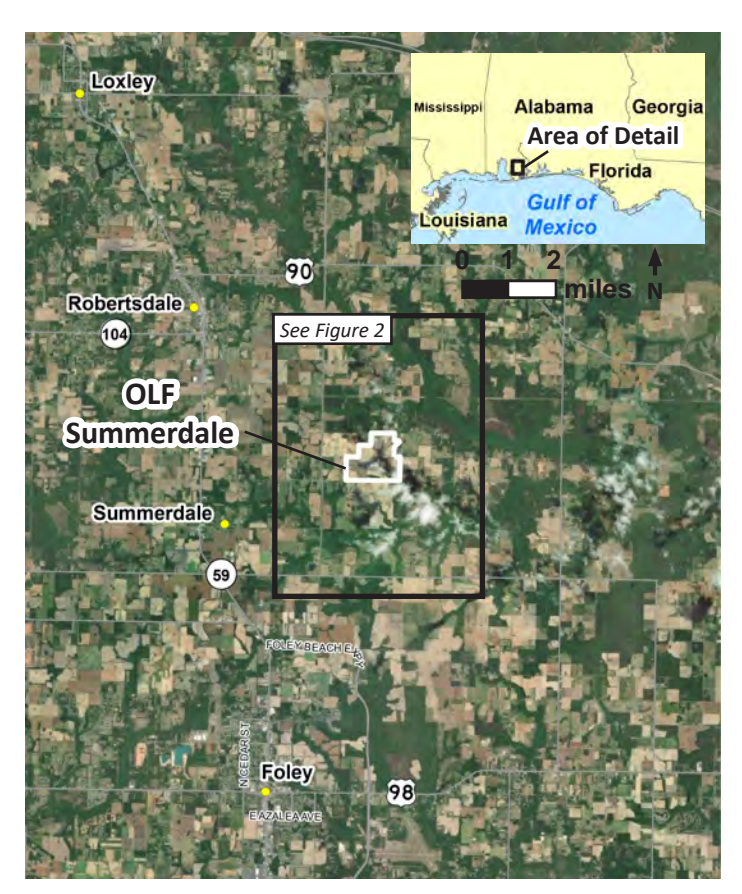
Figure 1 – OLF Summerdale

In 2020, a comprehensive Preliminary Assessment (PA) was completed at the OLFs in Alabama associated with NAS Whiting Field. It identified potential historical releases of firefighting foam to the environment during activities such as testing, training, firefighting, and other life-saving emergency responses. The PA confirmed that firefighting foam was released to the