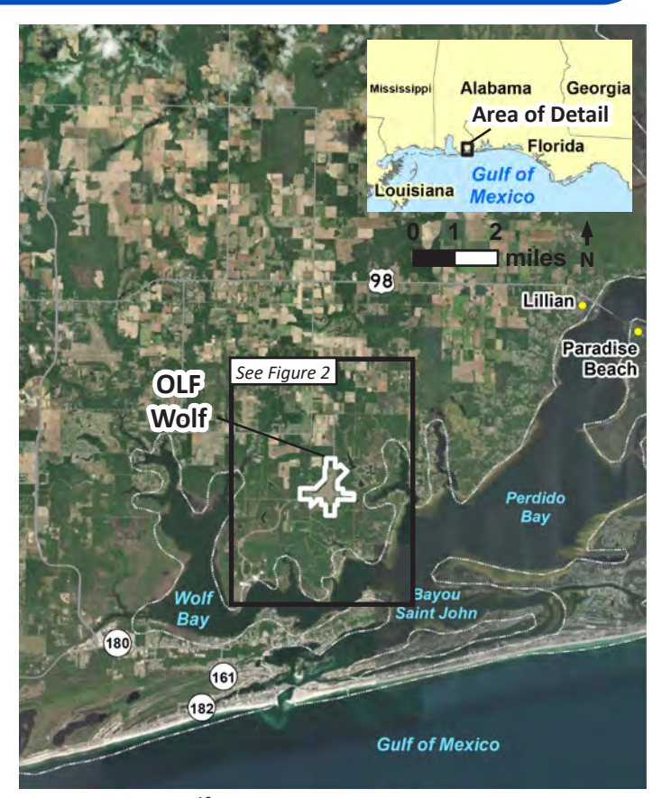
Figure 1 – OLF Wolf

There is no legal requirement to conduct this drinking water testing. The Navy is performing this voluntary testing because it is important