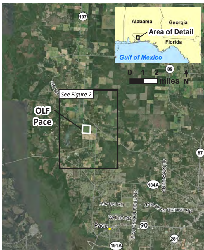
Figure 1 – OLF Pace

In 2020, a comprehensive Preliminary Assessment (PA) was completed at the OLFs in Florida associated with NAS Whiting Field. It identified potential historical releases of firefighting foam to the environment during activities such as testing, training, firefighting, and other life-saving emergency responses. The PA identified one site, the Firehouse/Blockhouse, where AFFF may have been released to the environment. At this site, PFAS may be present in groundwater, and may have migrated off-base to nearby drinking water wells (Figure 2). This