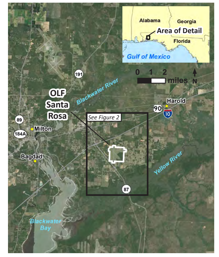
Figure 1 – OLF Santa Rosa

In 2020, a comprehensive Preliminary Assessment (PA) was completed at the OLFs in Florida associated with NAS Whiting Field. It identified potential historical releases of firefighting foam to the environment during activities such as testing, training, firefighting, and other life-saving emergency responses. The PA confirmed that firefighting foam was released to the environment at one site, the Firehouse/Blockhouse. It also identified additional sites, the Aircraft Mishaps, where