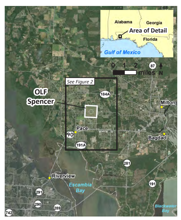
Figure 1 – OLF Spencer

In 2020, a comprehensive Preliminary Assessment (PA) was completed at the OLFs in Florida associated with NAS Whiting Field. It identified potential historical releases of firefighting foam to the environment during activities such as testing, training, firefighting, and other life-saving emergency responses. The PA identified three sites, the 2005 Aircraft Mishap, the 2016 Hard Landing, and the Firehouse/Blockhouse, where firefighting foam may have been released to the